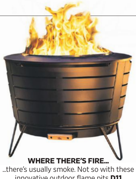
innovative outdoor flame pits D11