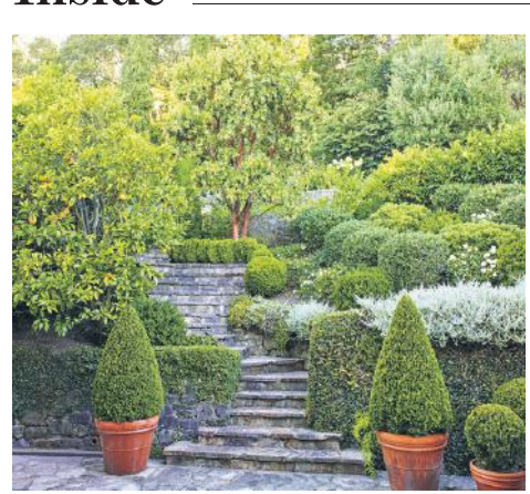
IF SO INCLINED How a garden designer turned a backyard of barren hills into beauty D10